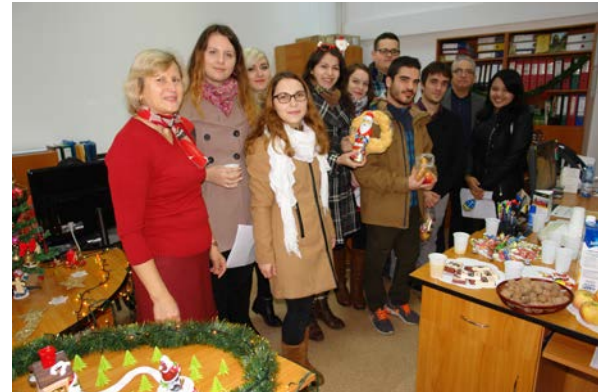
ESN and incoming students Christmas days in USAMV Iasi