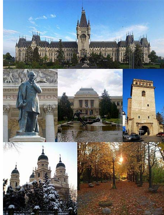
From top left: Palace of Culture, Vasile Alecsandri Statue in front of the National Theatre, Alexandru Ioan Cuza University, Golia Tower, Metropolitan Cathedral, and the Botanical Garden